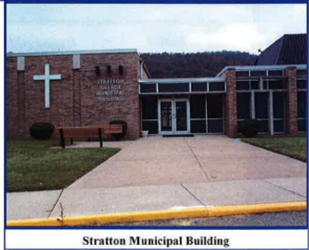
Stratton Municipal Building