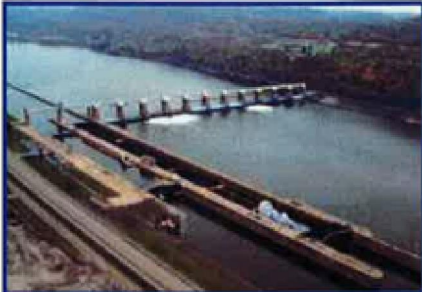
New Cumberland Locks & Dam

With a land area of just 0.5 square miles, you may not notice this tiny village of approximately 276 residents (as of July 2002) as you drive north along Ohio State Route 7 just 9 miles from Steubenville, Ohio. Instead, you are more apt to notice the New Cumberland Locks & Dam on the Ohio River or looking straight ahead you see the towering smoke stacks of the Ohio Edison Sammis Plant.