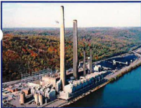
Ohio Edison Sammis Plant

The lock & dam, located on the right bank of the Ohio River, is just two miles downstream from New Cumberland, WV, which was originally planned to be the site of the lock and dam. The dam is a 1,200 by 100-ft main chamber that enables large tows to make passage through the lock.