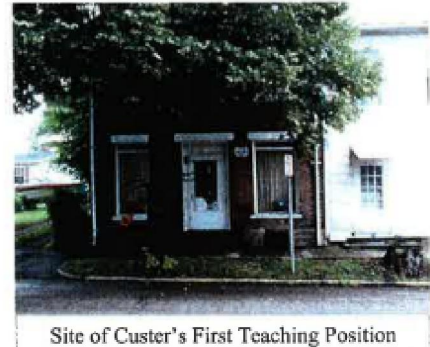
Site of Custer's First Teaching Position

ally the last weekend of September. It's the ideal time to walk through the village and experience a little of the history Smithfield has to offer.