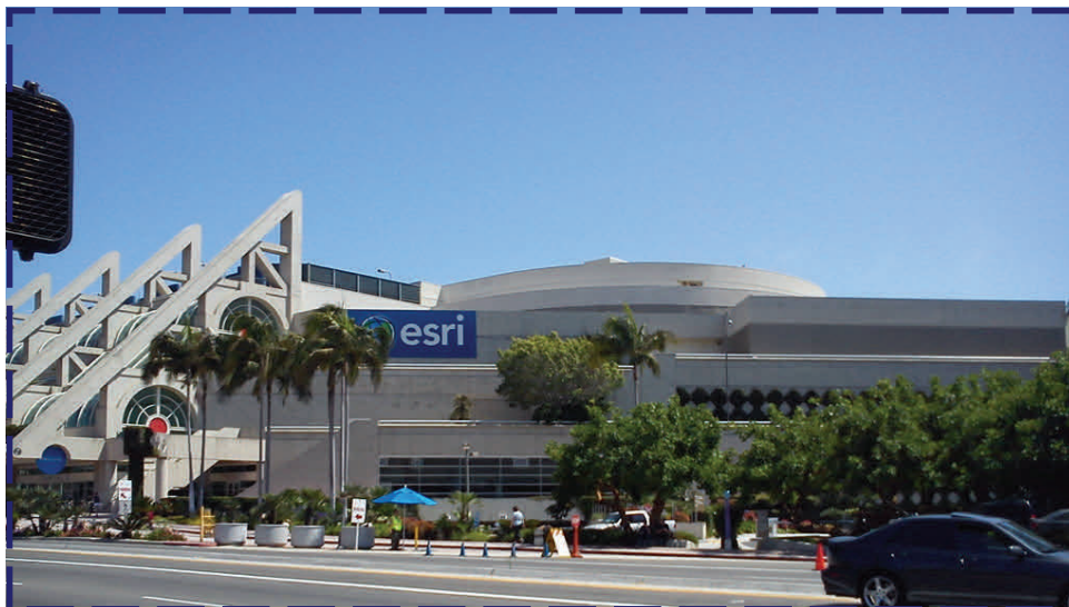
The San Diego Conference Center was the site of the 2014 ESRI International Conference July 14-18