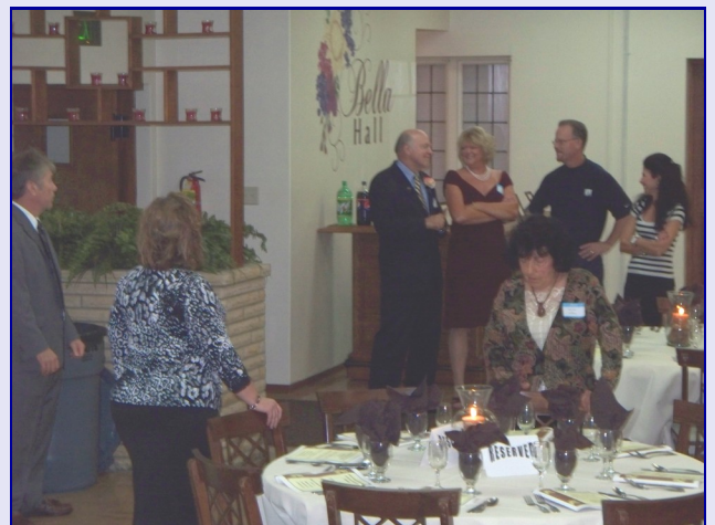
BHO Staff ready for the event.