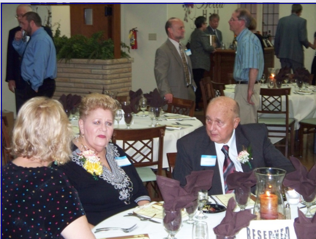
Enjoying the wine and cheese social hour