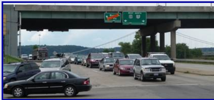
From left to right clockwise. The Ft. Steuben Bridge closed in January 2009 and scheduled for demolition in winter 2011; the Market St. Bridge deck under renovation and expected to open in November 2010; and the Ohio Route 7/University Boulevard intersection at the Veterans Bridge.

Our regional population of 130,000 depends upon our bridge system to minimize delay, provide job access and sustain road safety. At the direction of the BHJ Commission and our federal-state transportation partners, BHJ is working to assure these promises through a continuing program.