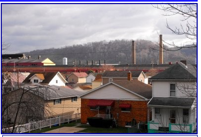
The Village of Yorkville

cessful seasons in the school's history. Wake Forest the only fatality.