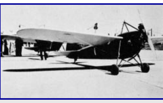
into Buhl Flying Bull Pup NC387Y. Charles Sugg crashed in this ship

made national headwhen lines Charles Sugg flying a Buhl Bull Pup plane, crashed hillside in а the Village