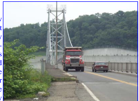
The Ft. Steuben Bridge, constructed in 1928, is proposed for demolition in 2009. Matched with the 100+ year age of the Market Street Bridge and access issues at the Veterans Bridge, WVDOT's announcement to progress the construction of a new Ohio River Bridge crossing is welcomed regional news.

to the posted limits. Unfortunately, since the current load limits have been in effect, violations have continued. Trucks continue to cross the Ft. Steuben Bridge with complete disregard to the posted limits. ODOT is making every effort to keep the bridge open to car traffic until its removal in 09, but if the current violation trend is not reversed, ODOT may find it necessary to close the bridge to all traffic at an earlier date."