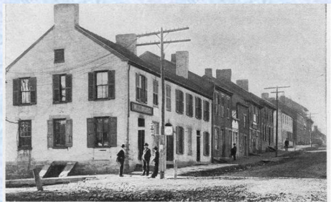
POST OFFICE, RICHMOND