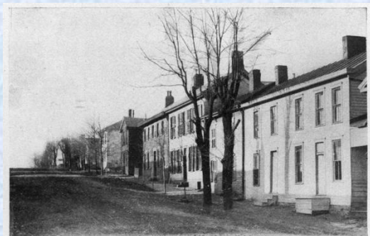
MAIN STREET, RICHMOND